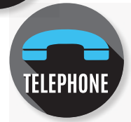
voice and remote programming use DKS service options for connection and programming