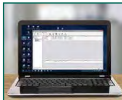
pc programmable easy to use software included