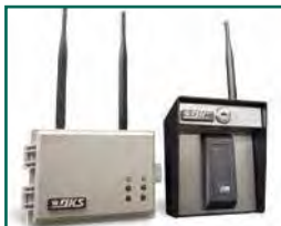
wireless expansion up to 48 entry points