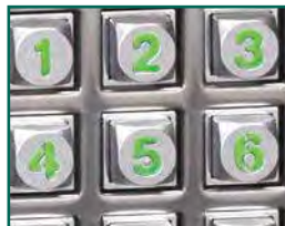
internal LED lit keypad and A-Z-CALL buttons