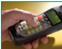
control access with a simple push of a button on your touch-tone telephone