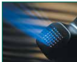
full duplex high quality communication