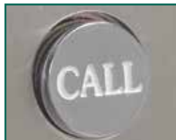
easily call with the push of a button