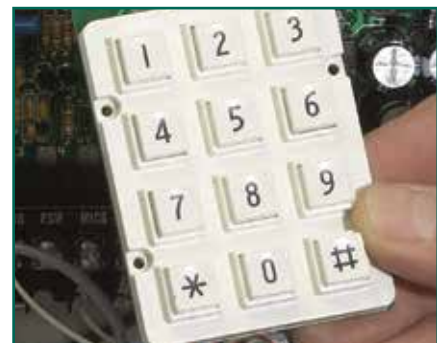
keypad programming manuel internal keypad for programming