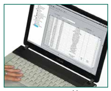
pc programmable Program the 1810 Access Plus from your PC