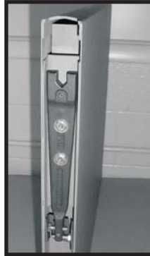
Figure 1a: Centering Bracket in top of door.

Attach the centering Bracket to the top of the door as shown in Figure 1a and attach the 218 Pivot to the bottom of the door as shown in Figure 1b.