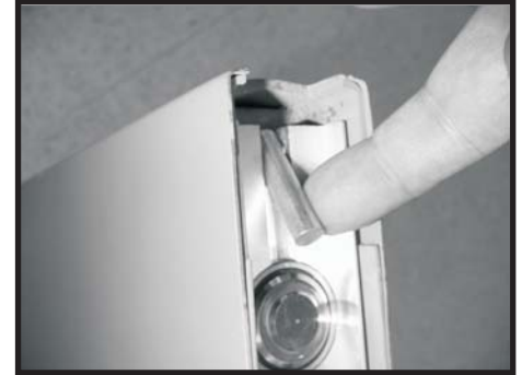
Figure 1b: 218 Pivot in bottom of door.