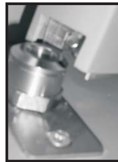
Figure 2b: Door placed on top of 218 Pivot.