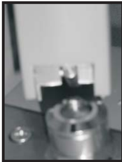
Figure 2a: Door placed on top of 218 Pivot.

Slide the door over the 218 Pivot, which is attached to the bottom of the door frame, see Figures 2a and 2b. Then, while the door is resting on the 218 Bottom Pivot, tilt the door, so that the opening in the top Centering Bracket fits into the main spindle located at the top of the door frame.