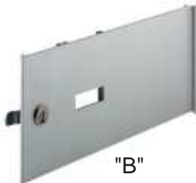
"B" 5" H x 12 1/2" W Door Size