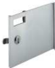
"2" 5" H x 7 1/2" W Door Size