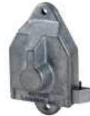
25322 Housing Only