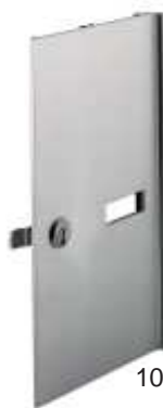
"C" 10 1/2" H x 6" W Door Size