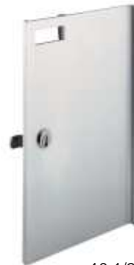
"4" 10 1/2" H x 7 1/2" W Door Size