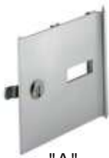
"A" 5" H x 6" W Door Size