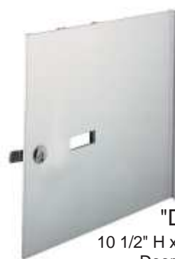
"D" 10 1/2" H x 12 1/2" W Door Size