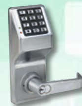
With IC Core in 26D DL2700IC/26D