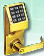
Lever set in US3 DL2700/3