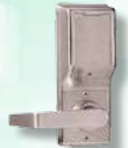
Secure battery compartment on inside door